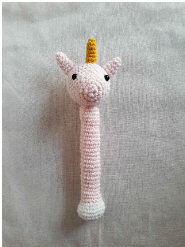
The horn and ears are attached