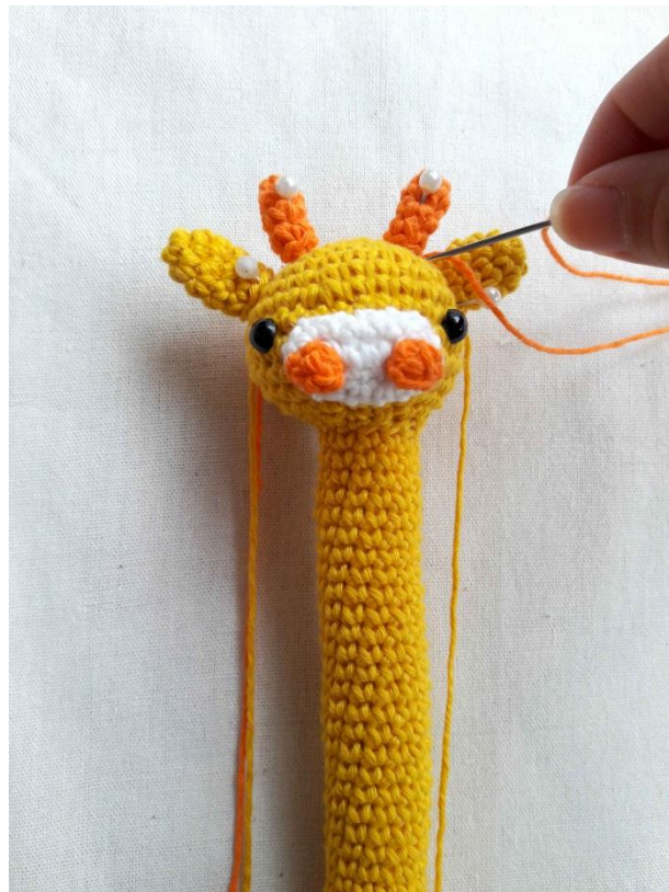
Sew horns and ears onto head