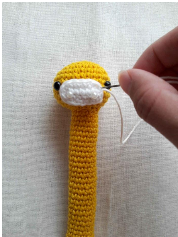
Attach the mouth