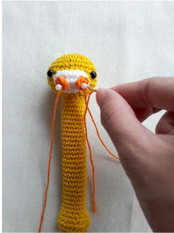
Sew the nostrils to mouth